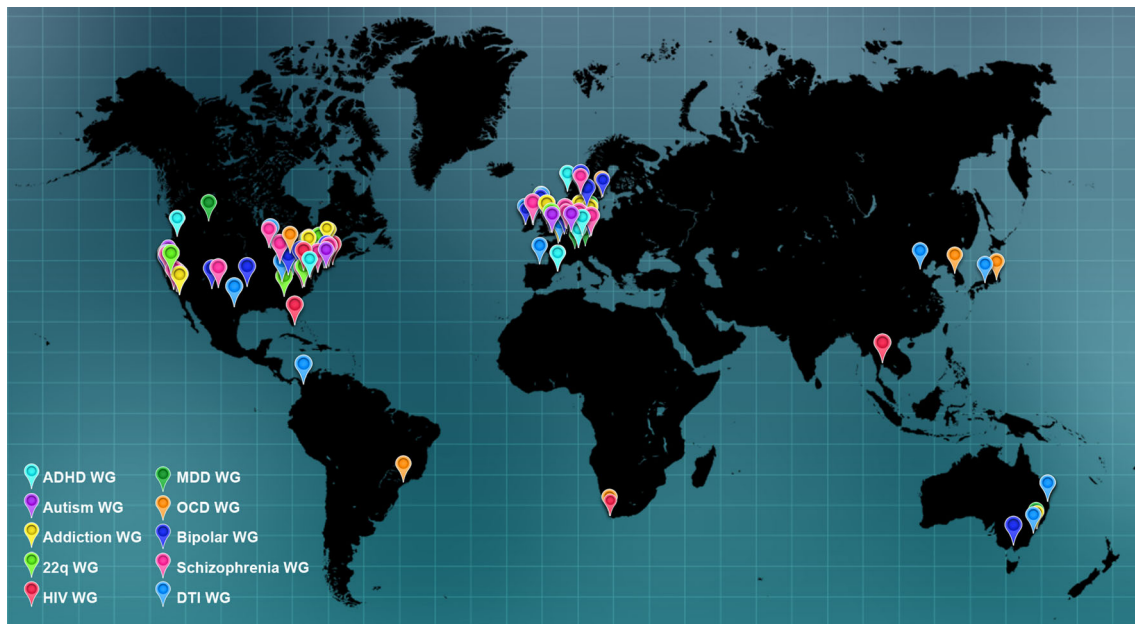
Fig. 5 Locations of the ENIGMA Working Groups. After ENIGMA's first project was completed (ENIGMA1; Stein et al. 2012), large amounts of brain imaging data had been analyzed from patients with a variety of psychiatric disorders. Working groups (WGs) were formed to understand the effects on the brain of bipolar disorder, major depressive disorder (MDD), schizophrenia, by pooling and comparing data from many neuroimaging centers. These groups are open to any researchers who have collected MRI scans from patients with these illnesses. No genetic

data is needed to join. In fact, most projects study factors that might influence how these disorders affect the brain—medications, geographic factors, and the age and gender of the patient. A further working group focuses on diffusion tensor imaging, which assesses white matter integrity; current projects relate DTI measures to individual differences in cognition and genetic make-up. The institutions in the working groups, as of June 2013, are shown on the map (see color key, inset)