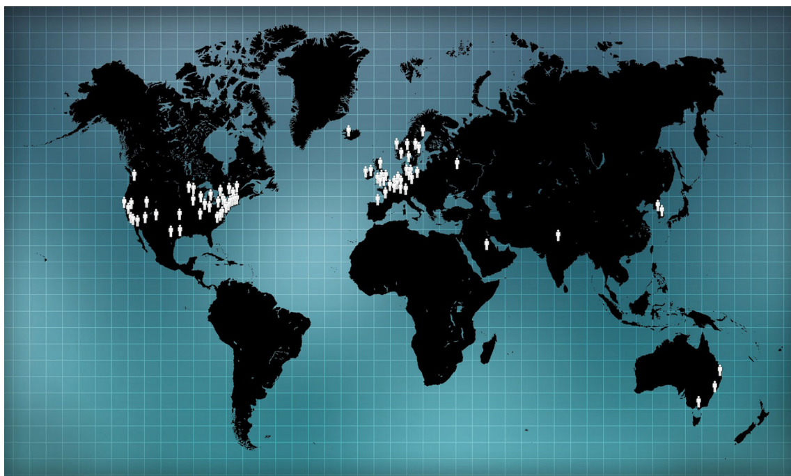
Fig. 2 ENIGMA founding sites. The first ENIGMA project (Stein et al. 2012) was initiated in 2009, by a consortium of research groups worldwide involved in neuroimaging and genetics. Several existing consortia and research networks are taking part, including IMAGEN, EPIGEN, SYS, FBIRN, and ADNI. Many of these efforts pre-dated

ENIGMA and continue today; each conducts its own projects in addition to their collaborative work within ENIGMA. ADNI collects data at 58 sites around the U.S.; for clarity, not all data collection sites are shown here. Each symbol represents a site contributing to ENIGMA, as of June 2013